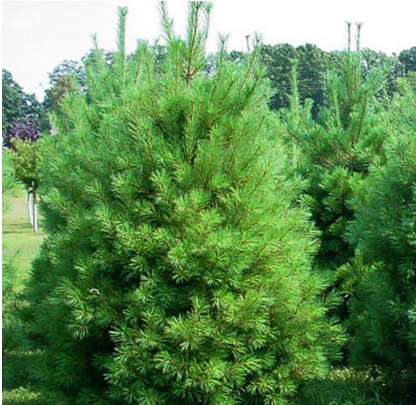
Eastern White Pine

In commemoration of Earth Day 2019, the Glen Park Chapter of the Izaak Walton League of America is giving away 100 Eastern White Pine and 100 Black Chokeberry sapling trees on Saturday, April 27, 2019. The event will be held between 12:00 p.m. and 3:00 p.m.